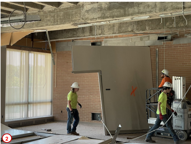
Photo #2 shows the contractors removing the last of the wall systems that used to comprise the Director and Administrative Assistant Offices in the northeast corner of the library. This space will be captured and will come part of the new library as it is reconfigured to fit the new layout of the first floor.