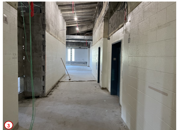
Photo #4 shows an innovative process that is happening with the CLRC project. Here you can see a 3D scanner at work creating a virtual model of the building. This virtual model of existing conditions will be merged with the already created version that the architects have been using for the construction documents. This will allow the architects and engineers to see if any adjustments need to be made to the design based on true existing conditions now that demolition is nearly complete, and hopefully avoid any unnecessary construction issues on the job site.