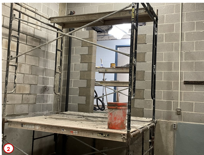
Photo #3 is a snapshot of the new entrance from Classroom C-10 into the landing of the west stair in the basement. The existing area under the stairs is being captured to create the room that will house the main fire riser for the new building-wide fire sprinkler system that is being installed to assist in bringing the structure up to current regulations. In the end this space was ideal for this as again it helped us repurpose some dead space in the building, but also because of its proximity to the main domestic water line coming into the CLRC. Having to run less piping to connect the riser to the water main ended up being a considerable costs savings over trying to connect into the old limited fire riser that is in the northeast corner of the building.