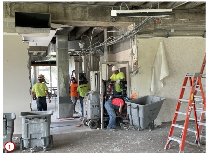
Photo #1 was taken in the area of the old reference section of the Library. Here one can already see the beginnings of the formation of the new main corridor that will connect the future east and west entrances on the first floor and provide the critical barrier free entry to the elevator which will help this building to finally be fully ADA compliant! Once the old infrastructure (mechanical and electrical) systems are removed the new framing required for the corridor walls can start to be erected.