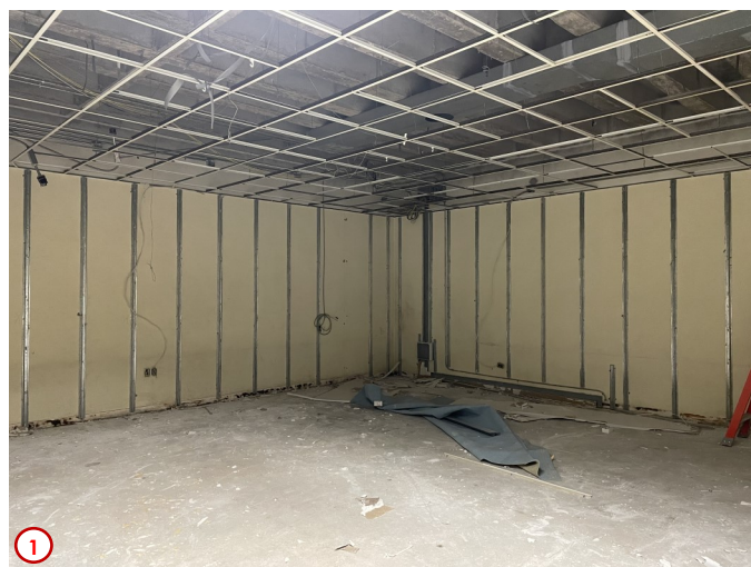
Photo #1 highlights the progress of the demolition of the existing finishes in the classrooms that are being redone as part of the overall project. In this particular classroom (C-8) there was more finishes to remove as this room had extra acoustical treatments due to it being used for web conferencing and learning.