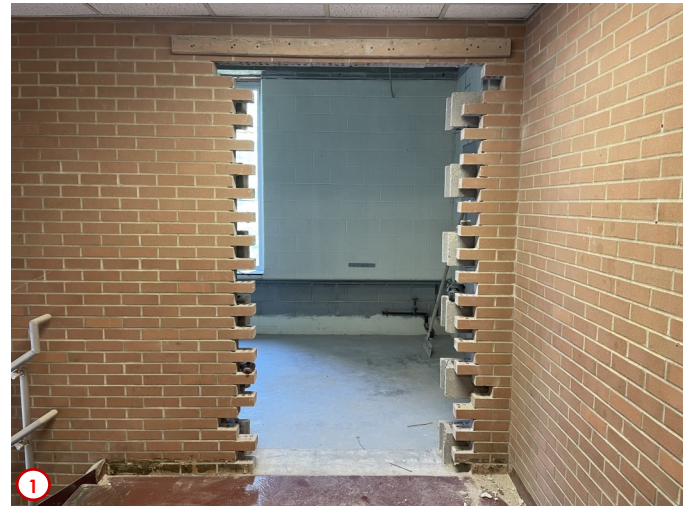
Photo #1 was taken on the top landing of the eastern stairwell. Here you can see the contractors have started creating the new opening that will serve as the emergency exit out of the new faculty lounge in the H/SS Division Office Suite.