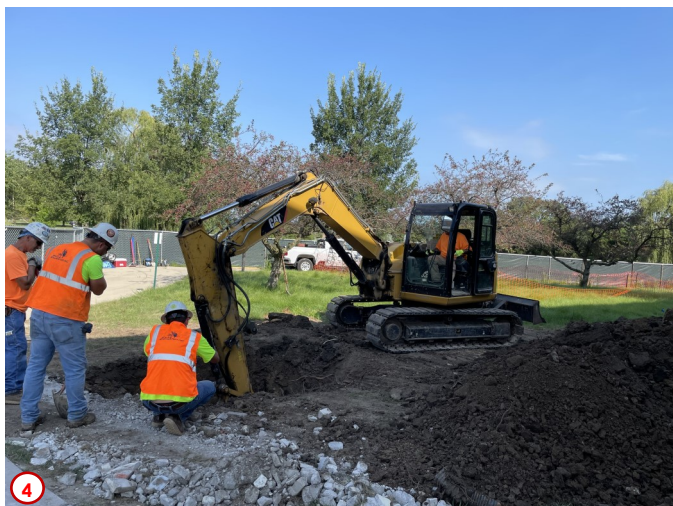
Photo #4 was actually taken outside the southwest corner of the CLRC. Here you can see the contractors "daylighting" or carefully digging to expose existing underground utilities in the area. This process was done for two reasons: 1) to verify the location and depth of the utilities in this area as this is where some footings will be installed for the new entrance canopy, and 2) to verify that there are no other unmarked utilities in the area as well (which does happen).