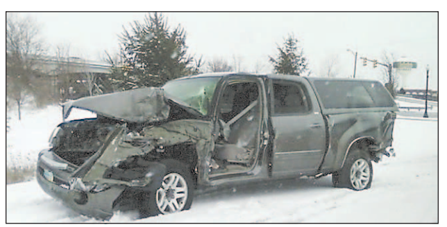
- Evening News photo by HARRY ORSCHELN

Around 1:45 p.m., an accident involving a semitruck and at least two