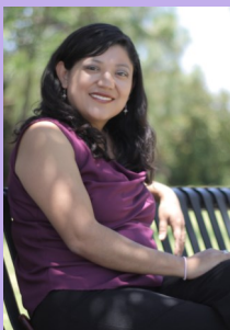
Featured book for 2014, The Distance Between Us by Reyna Grande.

Reyna Grande will visit the Monroe County Community College (MCCC) Campus on March 26, 2014. She will be meeting with students during the day. Afternoon and evening events include a VIP reception hosted by the OBOC committee and a public book signing and author presentation to be held in the MCCC La-Z-Boy Meyer Theater. The discussion and book signing are free and open to the public.