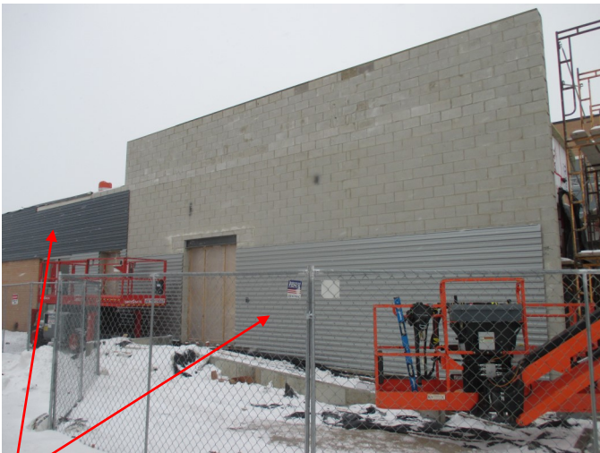
The top-left photo shows the progress of the installation of the new corrugated metal veneer panels on the north wall of the addition and existing building.

The following are pictures from the weeks of Dec. 25, 2017 - Jan. 5, 2018 in regards to the Life Sciences Building Façade Improvements and Addition Project. The extreme cold has caused another weather delay in the schedule, nonetheless the contractors are pushing forward and finishing as much work as possible inside the existing building until the addition is weather-tight. Tentatively, the roof for the addition is scheduled for installation next week, but with the potential of some rain/freezing rain in the forecast it might again be delayed. However, there has still been some good progress made with this project. Some more of the new exterior metal panels have been installed on the north wing and part of the addition. Also, more metal framing and gypsum board have been installed where the addition and existing building connect.