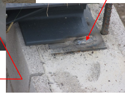
Bar joist seated on a bearing plate shop welded on the tube steel beam and welded in place on site.