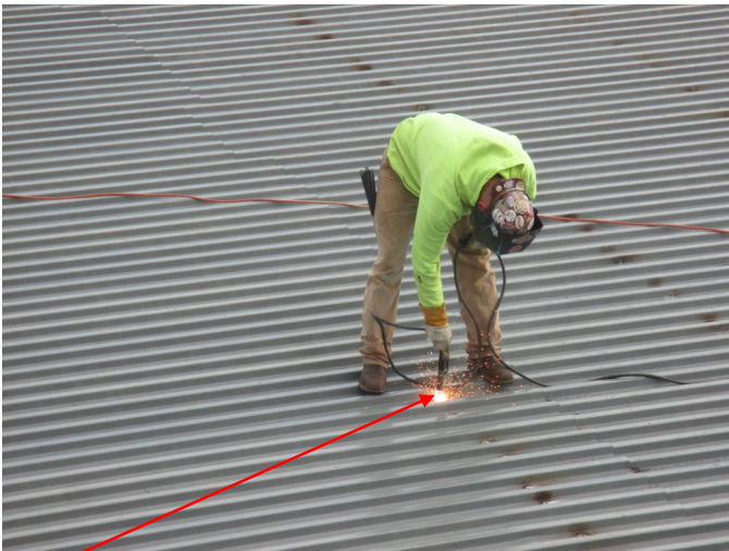
The top-left photo shows an ironworker welding the sections of metal decking for the roof of the addition. The pieces of metal decking are welded together and to the support bar joists.

The following are pictures from the week of Nov. 6 - 10, 2017 in regards to the Life Sciences Building Façade Improvements & Addition Project. There was a lot progress with past week with the installation of the steel supports for the sunshade system for the south face of the building. With the arrival of some of the panels for both faces the finishing of the support steel is very timely. There was also a lot of preparatory work that was finished in regards to the roof system for the addition. The remainder of the metal decking was installed and cut to size, welded, and it is now ready for the concrete roof slab to be placed next week along with the floor slab. Originally the contractor was going to place the two slabs on different days, but in the interest of less site disruption and commodity of savings both will be placed at the same time.