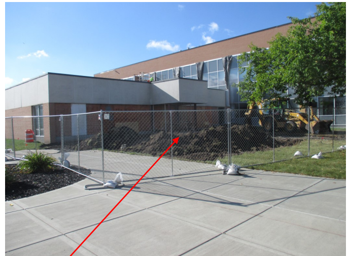
The top-right photo shows the start of the excavation of the footings and foundation of the addition on the northwest side of the building. This work will finish next week and then the contractor will place the necessary forms so concrete can be poured in place.