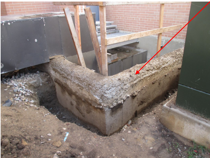
The bottom-left photo shows the mechanical area well on the northeast side of the building and the start of the much needed corrective work as part of this project. Here the first feet of crumbling concrete wall will be removed and replaced to properly support the metal grating.