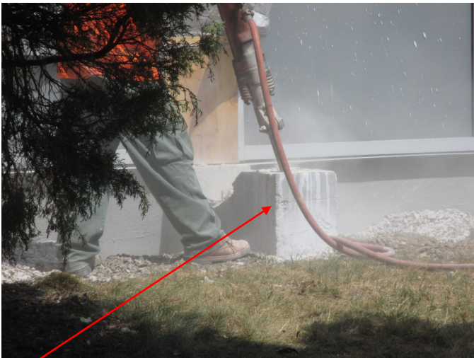
The top-left photo illustrates the work needed to cut back the old brick pier foundations as part of this project. The piers will only project 4" from the face of the building now, so that they can support the new brick veneer being installed soon.

The following are pictures from week of Aug. 14-18, 2017 in regards to the Life Sciences Building Façade Improvements & Addition Project. All of the sunshades panels, 50 of them, have all been officially removed from the north and south faces of the building. The rest of the associated brick piers are being removed, and soon new brick veneer will be installed in their place. The new steel connectors that will attach the new light-gauge metal shade systems will start being installed next week, with the systems going in later. Excavation work on the footings and foundations for the addition has started. Demolition has started on the mechanical area well concrete walls as part of the remaining corrective work that needed to be done as part of this project. Right now we are on schedule and satisfied that all of the major demolition was completed as planned prior to the start of classes for the Fall Semester.