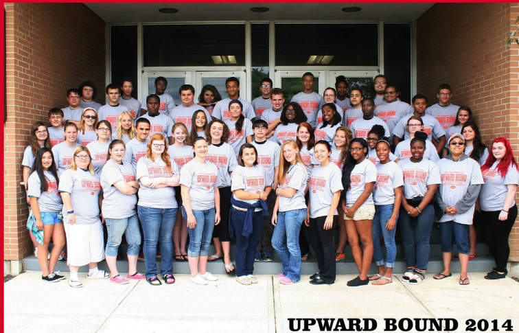
UPWARD BOUND 2014