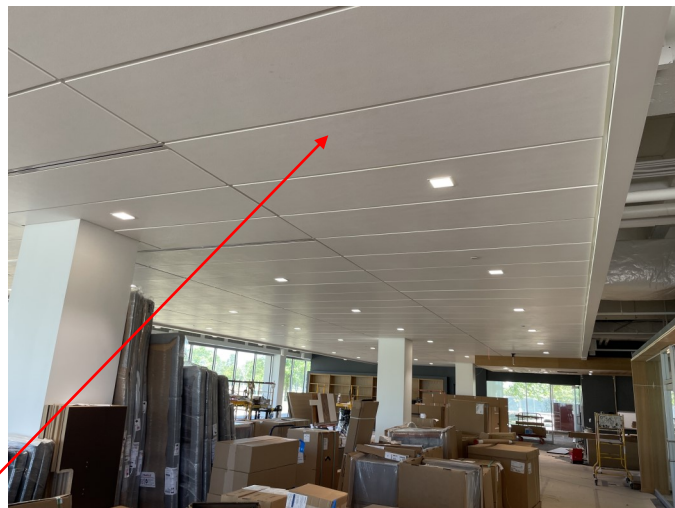
The top-right photo shows the now completed ceiling in the main area of the Learning Resources Center (library). You can see all of the boxed furniture sitting below which will start to be assembled and installed next week.