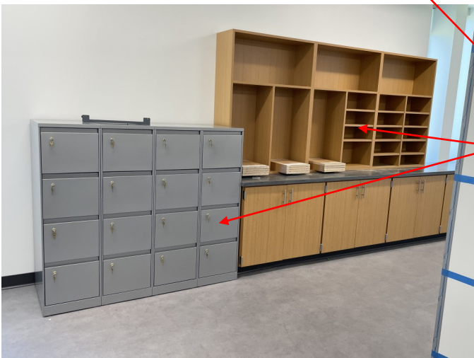
The middle-left photo was taken in the Adjunct Faculty Office in the H/SS Division Office Suite. The adjustable shelving will serve as mail slots for the adjunct faculty, and the filing cabinet will provide secure storage for files for the part-time instructors.