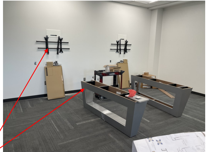
The top-right photos was taken in the active learning classroom on the 2nd floor and shows the beginning stages of the installation of the A/V infrastructure and the group learning tables.