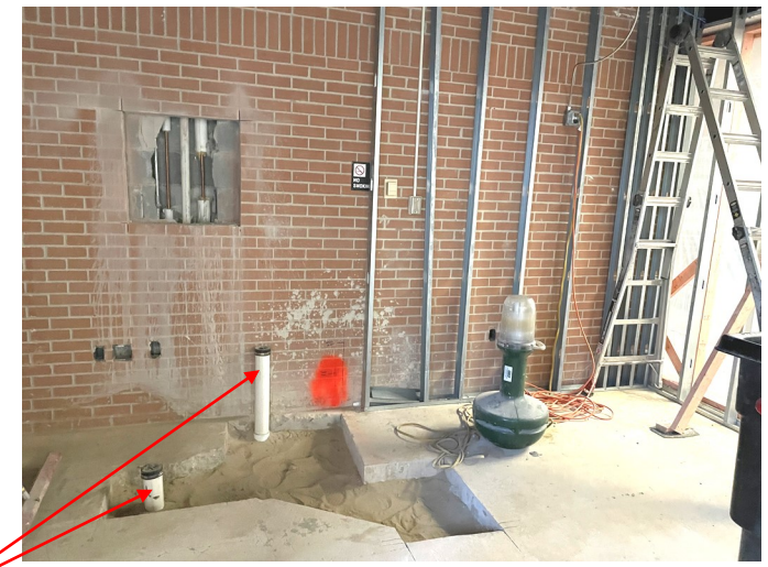
The top-right photo shows the completed rough plumbing installation. The two pvc pipes shown are for drainage of the sink and toilet that will be installed towards the end of the project in the future single-occupant (unisex) restroom.

The top-left photo shows the finished wall framing for both the future restroom and private room.