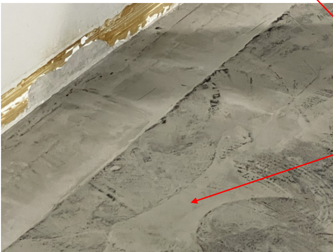
The bottom-left photo shows the results of the flooring contractors application of the skim coat that will help both level and prep the existing concrete floor slab to receive its future finishes.