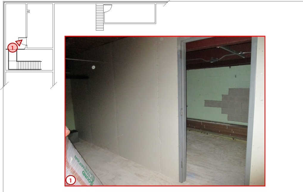
Photo #1 shows the progress of the work in the IT Room on the 2nd Floor of the Physical Plant. The new wall separating the new IT Room from the new dedicated mezzanine area has been constructed, and the door frame installed. Next up for this area is the insulation for the exterior walls and the new steel access stairs.

The following are pictures from week of 7.22.19 - 8.2.19 in regards to the Campus-wide IT Rooms Renovations Project. This project is progressing well as each of the new IT Rooms has been started, with a few nearly complete. All demolition and new masonry associated with this project is complete, and all new wall framing is finished as well. A lot of new areas of gypsum board (drywall) has been installed or is nearly finished. Painting is partially complete and a fair amount of other finishes needed have been started. Numerous new doors and frames will be installed in the next week and then will receive paint or stain shortly thereafter. Some of the new technology infrastructure items have been installed as well such as ladder racks and cable trays that will hold the new cabling that will be installed later. New HVAC systems and electrical gear are being installed that will power the equipment in these rooms. These new rooms will finish up shortly which will allow some other millage projects to begin.