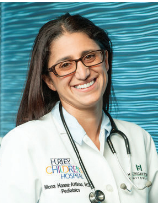
MSU Communications and Brand Strategy