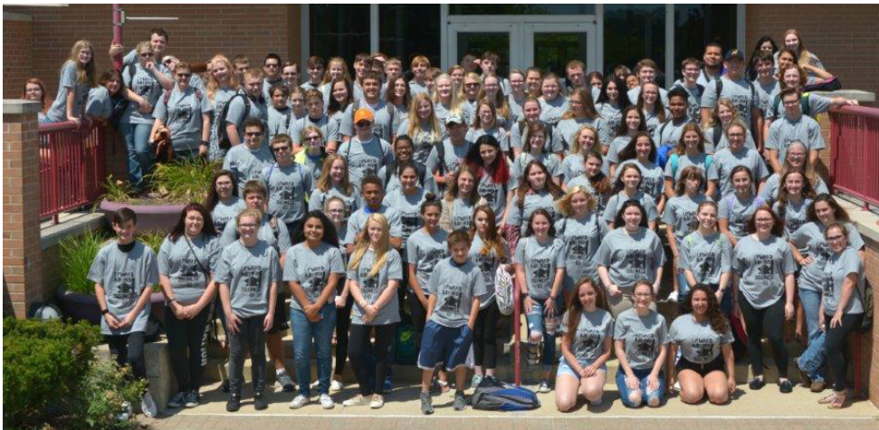
2018 Upward Bound Summer Participants