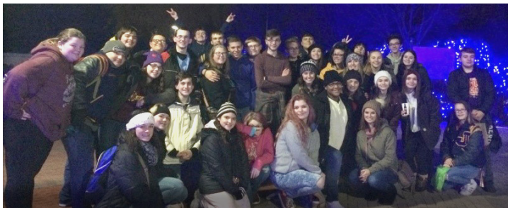
JHS (Above) and AHS (Below) students visiting the Toledo Zoo.