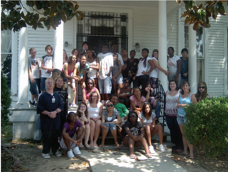
Students pose for a picture at the Burkle Estate.