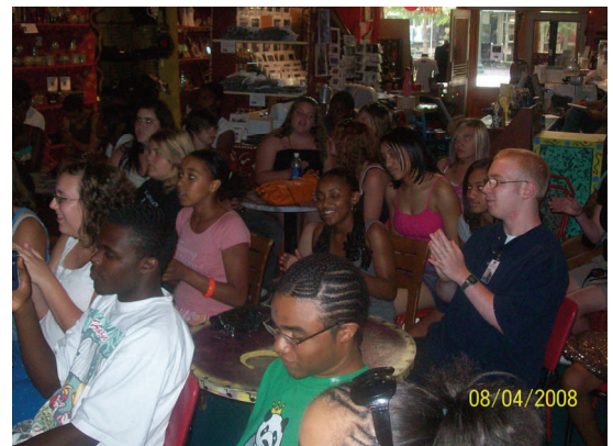
Students watching the performance of David Bowen at the Center for Southern Folklore