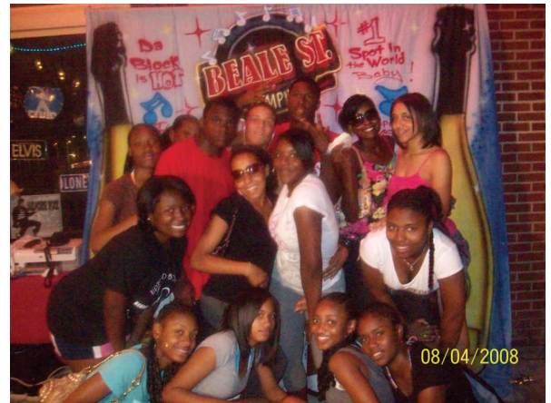
Students pose for a picture on Beale St. in Memphis