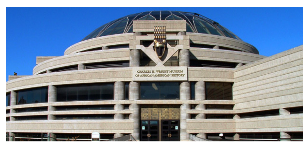
The Charles H. Wright Museum of African American History in Detroit