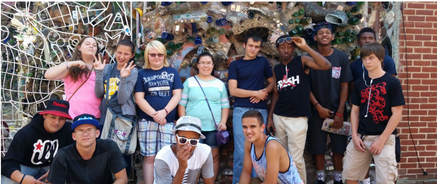
Upward Bound students visiting the Italian Market area of Philadelphia, PA.