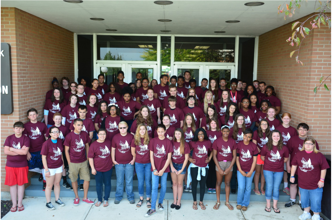
Upward Bound 2015 Summer Program Students