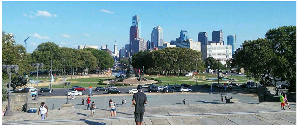
View of Philadelphia from the - "Rocky Steps" - Philadelphia Museum of Art

The City of Brotherly Love was the destination for summer 2015. Seventy-five students and nine chaperones traveled to Philadelphia, Pennsylvania. Our first destination was Hershey, Pennsylvania where we visited Hershey Chocolate World. Fun and chocolate was had by all. On to Philadelphia where we visited Valley Forge and toured a house actually lived in by the one and only George (and Martha) Washington.